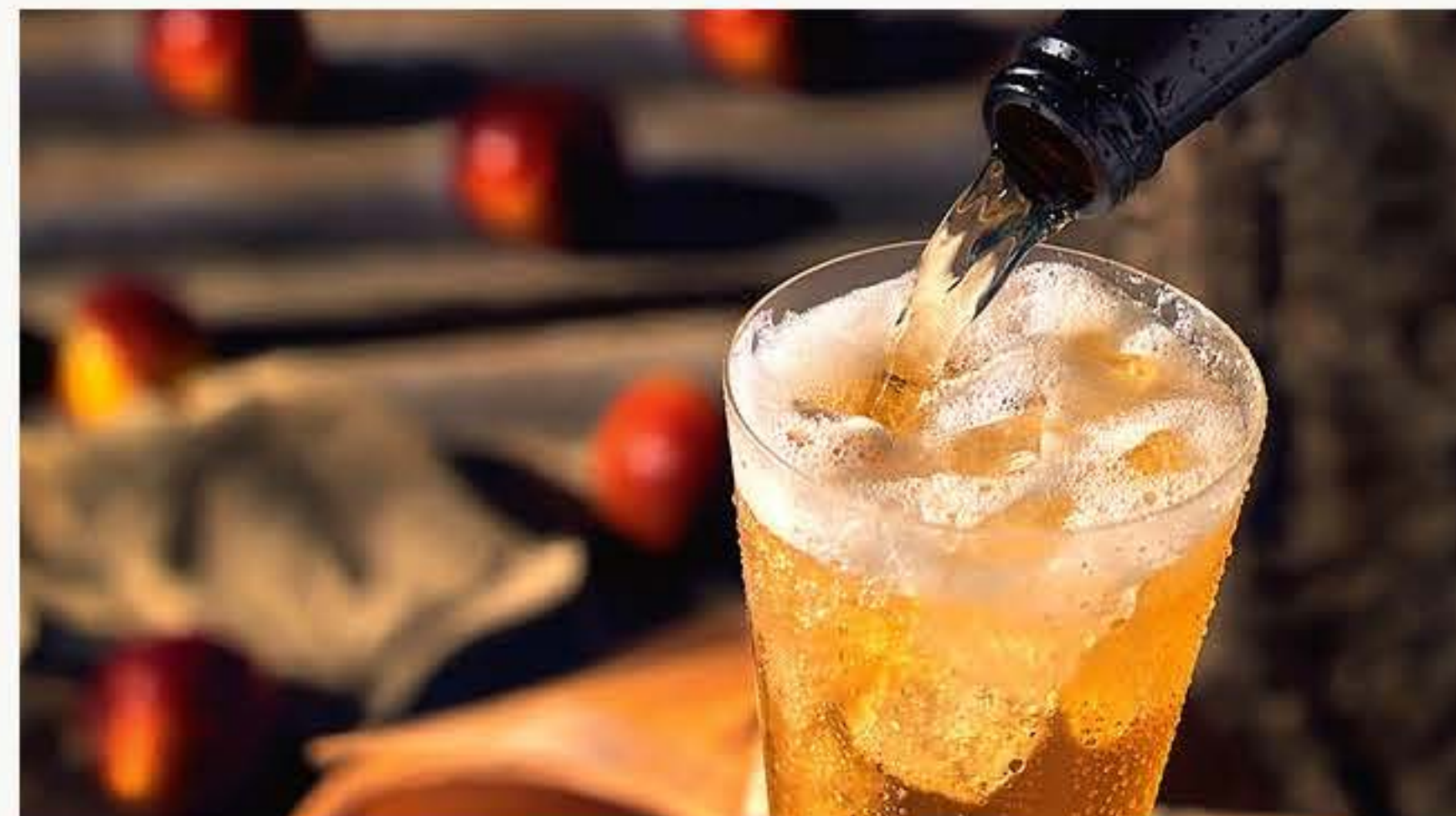
There's no better way to enjoy a lazy weekend arvo than with a cider over ice.